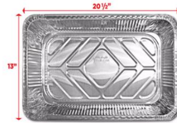
Full size pan